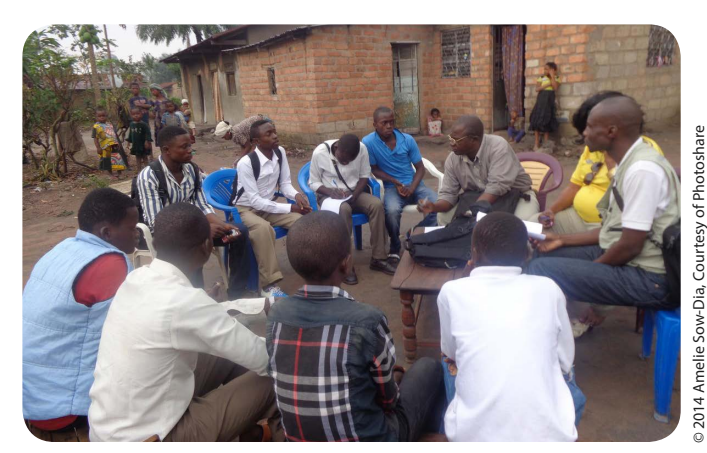
A Focus Group Discussion with young men in rural Mwene-Ditu, East Kasai Province, Democratic Republic of Congo

Communication for social change should be empowering, horizontal (versus topdown), and biased toward local content and ownership, and it should give a voice to previously unheard community members. Group dialogue, reflection, and