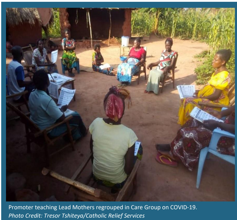
Promoter teaching Lead Mothers regrouped in Care Group on COVID-19.

Another challenge to note is that managing water points is a new concept for all the WMCs managing boreholes. Scenario building has been a powerful tool to help WMCs apply the administrative, financial, and technical management of water services. Similar to storytelling, WMC members were able to learn potential risks and threats to the functionality of their water services through different illustrative scenarios. Using scenario building became efficient in convincing organized community groups, like the WMC, to adapt key prevention measures. WMCs were able to rapidly adopt COVID-19 measures due to income from providing water services and an established decision-making process that allowed them to approve expenses related to handwashing stations and soap. Clearly written and legally approved internal regulations also allowed WMCs to adapt to immediate needs.