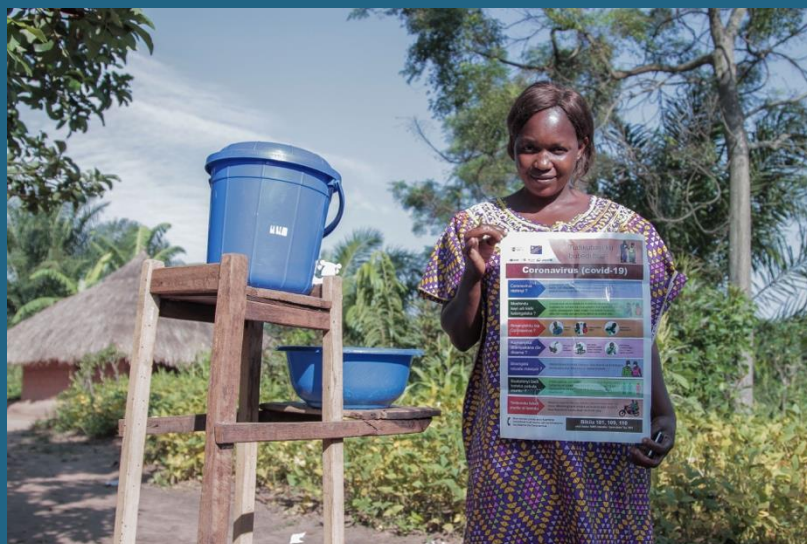
Care Group Volunteer with COVID-19 visual aid.

Radio programming ensures that timely and accurate information counteracts the myths and misinformation circulating around COVID-19. Budikadidi was able to use existing community radio partner partnerships to rapidly pivot programming to disseminate information from the World Health Organization on COVID-19 and Ministry of Health (MoH) early on in the pandemic. Physicians, the head of the Provincial Health Department, Budikadidi staff, and community members participated in the radio shows. These shows provided easy-to-understand information about disease transmission/prevention and dispelled common myths about COVID-19. An interactive discussion allowed listeners to call in and share their own stories on adapting to COVID-19. Youth radio listening clubs that were meeting weekly began playing a vital role in organizing small group discussions in open areas to discuss the content (while ensuring social distancing).