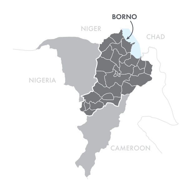
Figure 1: Map of NE Nigeria

Research shows that markets<sup>2</sup> and social networks<sup>3</sup>—family, friends, and neighbors—are critical sources of resilience in protracted crises, where formal governance is largely weak or absent altogether. We are also learning that self-efficacy, agency, and confidence in the future are important predictors of an individual's or household's ability to escape and remain out of poverty in the face of shocks.<sup>4</sup> This evidence begs the question: How do we strengthen these important sources of resilience in protracted crises? This learning brief sheds light on this question through a case study of two market-based programs in northeast (NE) Nigeria. We find that livelihood interventions paired with economic collectives<sup>5</sup> are effective at strengthening resilience capacities such as reciprocal social connections, empowering women, and improving psychosocial well-being, specifically perceptions of one's own agency and confidence in the future. In this brief we share three key pathways through which this combination of interventions has a positive impact on social and psychosocial sources of resilience, and where we can go next with these findings.