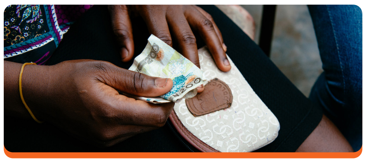
A woman participant from a VSLA in Lagos, Nigeria.

KEY TAKEAWAY: Livelihood interventions and VSLAs can provide a foundation for women's empowerment, even in crisis contexts. This finding is predicated on the economic feasibility and viability of the underlying livelihoods and financial freedom to save, borrow, and expand or diversify livelihoods, as well as the gender composition of groups. Interventions that foster egalitarian gender practices and empower women are important in all contexts, and more so in conflict settings.