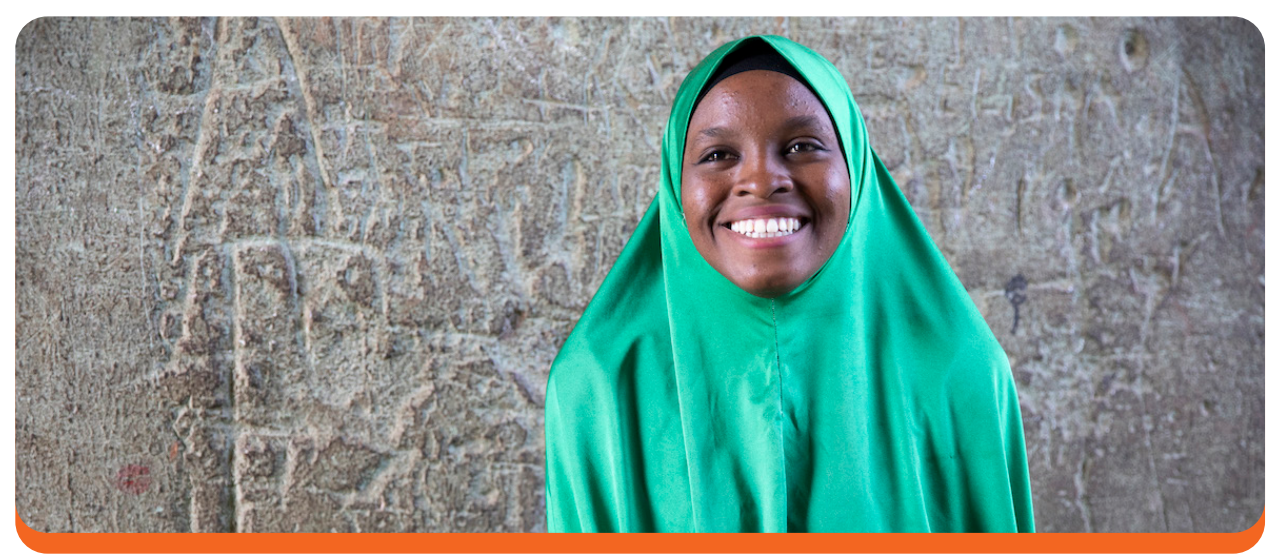
A young woman in Biu, Nigeria who saves income from her small sugar business in a VSLA.

complex and multidirectional. Recognizing that shocks are recurrent and vary in scale, magnitude, and impact is equally important for the well-being of conflict-affected populations.