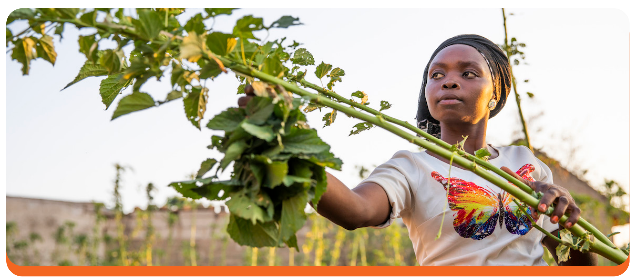
A woman prepares to dry maize in front of her home in Borno State, Nigeria.

Excerpts from interviews with male and female farmers from the MAIDA program to understand what has changed as a result of men and women working together.