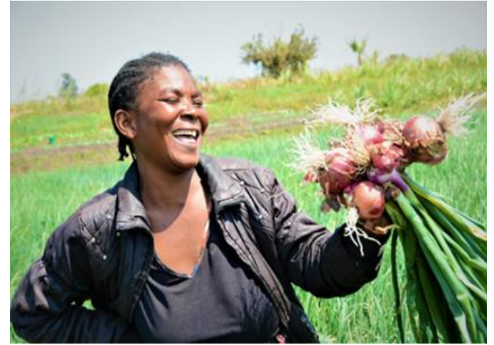
PIU farmer in the onion value chain marvels at her harvest