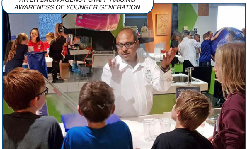
RIVER-BASIN AGENCY STAFF RAISING AWARENESS OF YOUNGER GENERATION

Surface-water bodies tend to be flow-dominated, whilst most aquifers are characterized by large natural groundwater storage and much lower flow rates. This reality has very important practical implications for integrated water resource management, since surface-water resources simply cannot be effectively managed unless the task is performed on an integrated basis with groundwater resources. Conceptual models need to be developed which clearly reveal the relevance of groundwater to the functioning of the river basin.