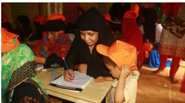
A literacy class with Rohingya women and girls conducted in the Rohingya camp in 2018

The young women are also working to dispel anti-Rohingya rhetoric and promote social cohesion between the refugee and host communities. Negative stereotypes of the Rohingya refugees are common in Bangladesh, including in local communities where GNWP works. At the beginning of the YWL training program, the young women described the Rohingya as bringing traffic to their streets and crime to their communities. However, after regularly interacting with Rohingya refugee women