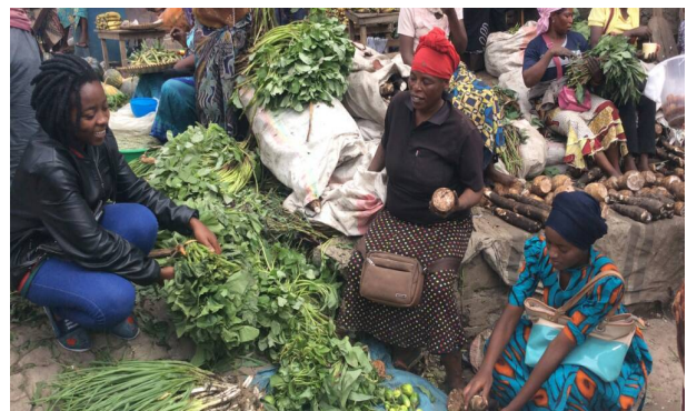
YWL member speaking with market vendors in Goma during a field visit

Young women in North Kivu, including SGBV survivors, have started their micro-