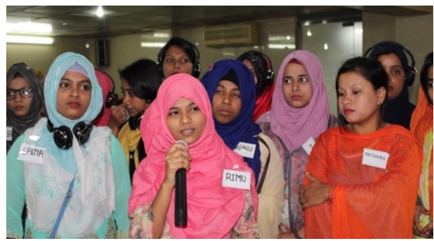
Leadership and peacebuilding workshop with young women from host communities in 2019