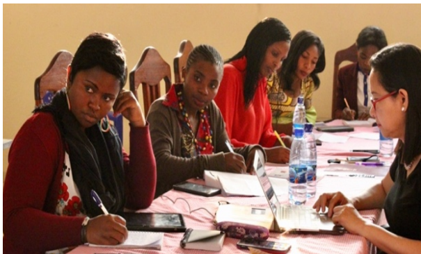
Members of GNWP's YWL Program at a training in 2018

business with GNWP's economic empowerment capacity-building support and seed funds. The young women re-invest their earnings to organize literacy and peacebuilding training in nearby rural areas. They have also generated support from community elders and religious leaders to condemn impunity for sexual violence. In South Kivu, the YWL visit local communities to conduct sensitization and training on women's rights issues. They prepare "period kits," which enable girls and young women in neighboring communities to maintain menstrual hygiene. Women's and girls' inability to manage their menstrual hygiene in schools or at work results in absenteeism, which in turn deny them important opportunities in life and prevents them from contributing to the development of their communities. They also hosted a monthly radio broadcast on topics like prevention of conflict and sexual violence and promotion of relief and recovery. As a result