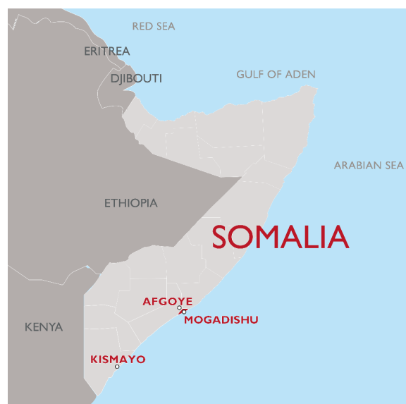
Figure 3. Map of SQ-LNS program sites in Somalia

In Somalia, GlobalMedic collaborates with a national implementing partner to implement the SQ-LNS program in Afgoye, Beletweyne, Kismayo, Mogadishu, Wanleweyn (figure 3). The national implementing partner in turn partners with local NGOs to implement the SQ-LNS program. During the data collection period for this learning activity in 2021, the FEWS NET predicted that poor deyr rains since October 2021 would intensify food insecurity in Somalia (FEWS NET 2021b). Prolonged drought would contribute to water shortages, the likelihood of crop failure, increased staple food prices, and high levels of livestock losses. Most of the program implementation sites were classified as being at IPC level 3: crisis levels of food insecurity, with Afgoye deemed to be at IPC level 2: stressed levels (FEWS NET 2021b). Several program sites (e.g., areas between Mogadishu and Kismayo) were also affected by Al Shabab (extremist group) activity (Council on Foreign Relations 2021). The prevalence of global acute malnutrition among children under five years of age in Mogadishu and Kismayo was projected to be 10 percent to 14 percent (FSNAU and FEWS NET 2021). The Somali Demographic and Health Survey found that nationally, 27 percent of children under five years of age were stunted. The same survey found that 15 percent of women of reproductive age were underweight, but that 33 percent were overweight/obese, and the prevalence of anemia was 49 percent (Directorate of National Statistics 2020).