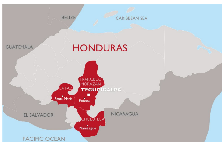
Figure 1. Map of SQ-LNS program sites in Honduras

In Honduras, Americares partners with the Honduran Order of Malta to implement the SQ-LNS program in five departments of the Dry Corridor: Francisco Morazán, La Paz, Valle, Comayagua, and Choluteca (figure 1). During the data collection period for this learning activity in 2022, the FEWS NET predicted that departments in the Dry Corridor would experience IPC level 3: crisis or higher levels of food insecurity (FEWS NET 2022). The 2019 Demographic and Health Survey/ Multiple Indicator Cluster Survey estimated that the overall prevalence of stunting in Honduras was 13 percent and wasting was 2 percent (Instituto Nacional de Estadísticas y la Secretaría de Salud de Honduras 2021). However, the prevalence of stunting in the five departments where SQ-LNS was programmed was between 15 percent and 35 percent. The survey also found that nationally the prevalence of underweight (body mass index <18.5 kg/m 2 ) among women of reproductive age was 4 percent and the prevalence of anemia was 22 percent (Instituto Nacional de Estadísticas y la Secretaría de Salud de Honduras 2021).