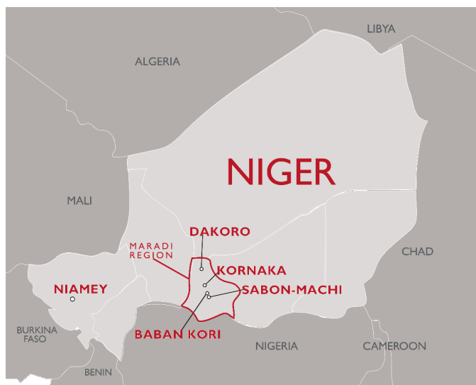
Figure 2. Map of SQ-LNS program sites in Niger

In Niger, ALIMA partners with BEFEN to implement the SQ-LNS program in Dakoro district of Maradi region (figure 2). During the data collection period for this learning activity in 2021, the FEWS NET predicted that Dakoro district would experience IPC level 1: minimal levels of food insecurity, which means that households in this area were able to meet their food and non-food needs without engaging in atypical and unsustainable strategies to access food and income (FEWS NET n.d.; FEWS NET 2021a). However, certain districts adjoining Dakoro district were classified as stressed or minimally stressed, but likely to be at least one phase worse without the current programmed humanitarian assistance (FEWS NET 2021a). A Standardized Monitoring and Assessment of Relief and Transition (SMART) survey from 2020 estimated that the prevalence of global acute malnutrition in the Maradi region was 13 percent and the prevalence of stunting was 58 percent among children under five years of age (Institut National de la Statistique, Niger 2020).