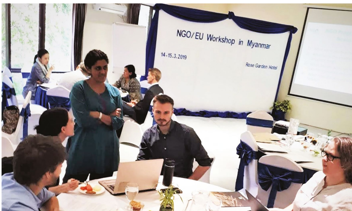
The Nexus workshop in Myanmar

Before discussing the different types of nexus programming being undertaken by NGOs in Myanmar, the example of the Durable Peace Programme (DPP) was presented as a long-standing programme in Kachin and Northern Shan, which is being implemented by a consortium of national and international NGOs. Other examples highlighted by NGOs of good nexus programming covered different regions and sectors, including: education in Kachin and Northern Shan; a rights-based empowerment approach; and an area-based rehabilitation approach in Kachin. (See Annex 1 B for more details of some of the good practices identified.)