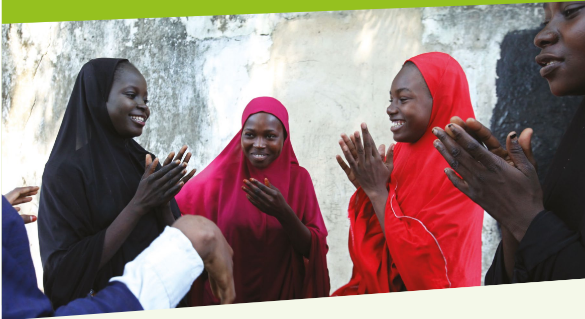
Adolescent girls in Nigeria.

Given the protracted nature of the crisis in the Lake Chad region, Plan International (PI) developed a regional Lake Chad Programme Strategy (2018-2023) that outlines the organisation's ambition to transform the life of girls and their families in the Lake Chad Region. The Strategy moves beyond a humanitarian vision towards a full spectrum programme, working at the nexus of humanitarian and development efforts to promote children's rights and gender equality.