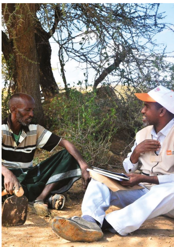
NGOs at work, Restoring hope to recover after Cyclone Sagar, Somalia.

It is important to note that the work undertaken by NGOs has focused on individuals and communities affected by disasters and conflicts. This approach is unlike many of the current nexus discussions in which States and the UN often emphasise the need to build State resilience and work with State actors.