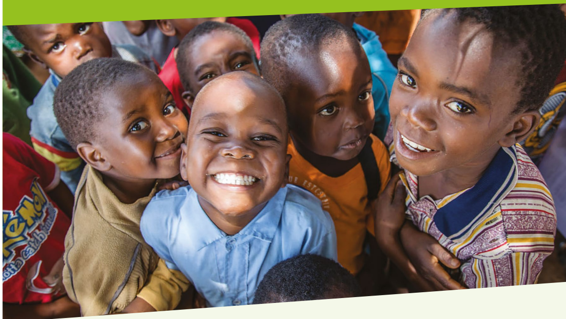
Children in a preschool in Zomba District

An on-going development programme in Malawi, called FUTURE (Food and NUTrition for RESilience) was funded by DEVCO and implemented by a consortium (United Purpose, Save the Children, and Concern Worldwide), in partnership with governmental stakeholders from November 2017 to November 2020. FUTURE delivers a comprehensive package of interventions designed to break the cycle of food and nutrition insecurity in Malawi. It improves the capacity of households to prepare for, withstand, and bounce back during and after shocks. It creates direct synergies with the government's National Social Support Programme (NSSP) and linkages with resilience-building approaches and actors. The FUTURE project provides social cash transfer top-ups through manual payments for households that are fully labour-constrained to enable them to be more resilient to food and climate change shocks.