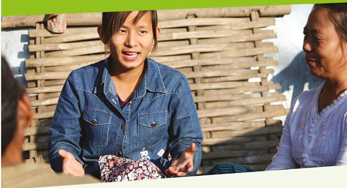
IDPs in North Myanmar

The DPP works across the triple nexus (humanitarian-development-peace) in Kachin and Shan States in Myanmar. Initiated in 2014 by the Joint Strategy Team (a group of local NGOs (LNGOs)), they subsequently asked international NGOs (INGOs) to join. The consortium, currently led by Oxfam, is diverse and the design and implementation of the programme is driven by 27 local organisations, ranging from small-scale community development associations to those with influence in the national peace process. They bring their diverse expertise together to enable the delivery of a range of activities across the 'triple nexus' of humanitarian, development, and peace spheres.