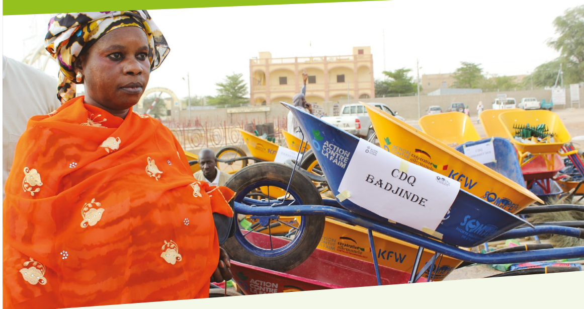
Delivery of sanitation kits to women's organizations in Tombouctou.

Action Against Hunger in Mali has been implementing two complementary projects: a development project (December 2015-September 2019), Integrated project to strengthen the resilience of rural communities in Kita and Timbuktu circles in Mali , and a humanitarian project (April 2018-March 2019), Integrated response to the humanitarian nutritional crises in Timbuktu and Taoudenit, North of Mali . The two projects were developed based on Action Against Hunger joint analysis and objectives.