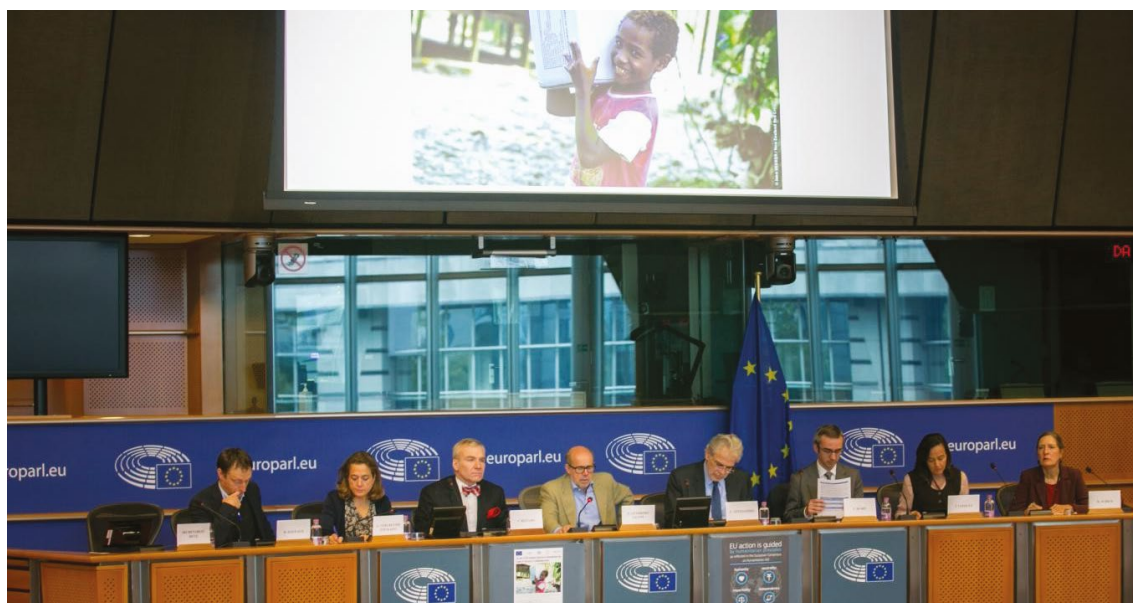
The European Parliament, Council and Commission reconfirming the relevance of the European Consensus on Humanitarian Aid in 2017.

In 2007 VOICE members were very engaged in the development of the European Consensus on Humanitarian Aid (recently reconfirmed by its signatories, the European Commission, Council, and the European Parliament), which further emphasised the importance of coordination between humanitarian and development actors for LRRD to be successful.