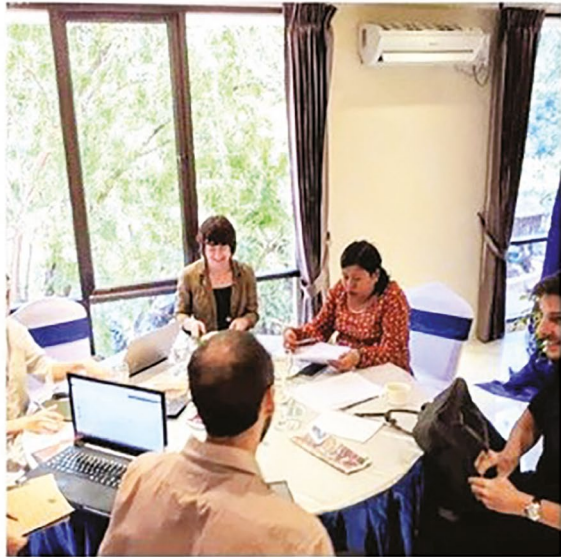
The Nexus workshop in Myanmar