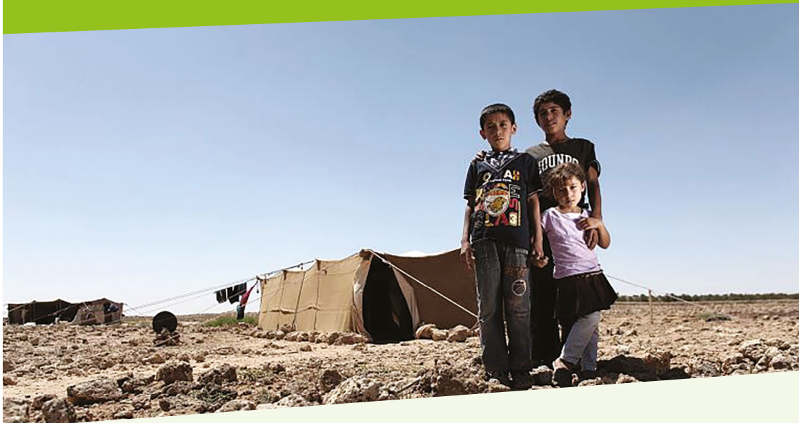
Syrian refugee family in Jordan.

Instead of having separate humanitarian and development programmes, CARE Jordan merged its activities into one holistic programme in 2014. This approach transcends sector-thinking and allows for cross-fertilisation between humanitarian and development approaches to identify the most appropriate response to the needs and vulnerabilities of affected individuals and families, irrespective of their nationality.