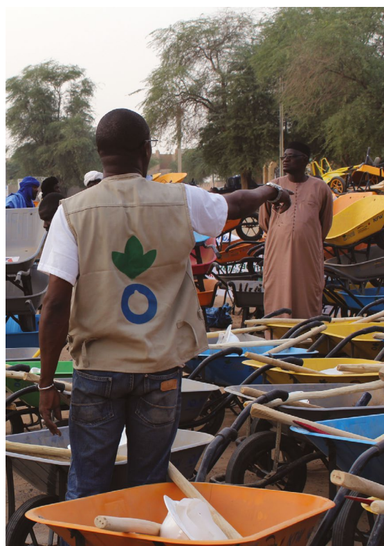
NGOs at work, Mali