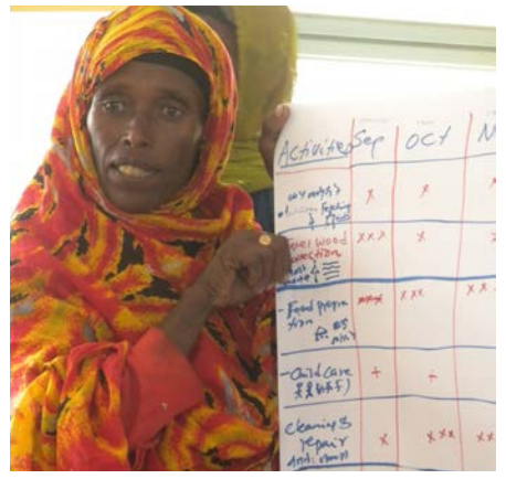
Woman participant reporting on community women's daily calendar in Dodota (Arsi Zone).

men are more responsible for producing and selling larger cash crops. In Arsi and EH zones, women tend to have smaller garden plots, which require their labor all year round.