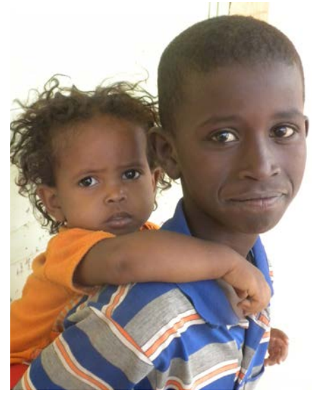
Boy with child on his back in Aseliso kebele (Dire Dawa Administrative Council).

Men and women also participate in public works related to natural resource management and construction and maintenance of schools and roads. Women play important community roles in building social cohesion and are often active in government volunteer structures at village cluster, village and smaller neighborhood levels.