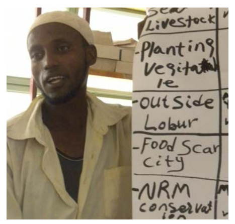
Man from Dodota (Arsi Zone) presenting the men's daily calendar to the focus group.