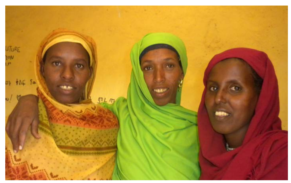
Three women participants in Belewa kebele (Dire Dawa Administrative Council) focus group.