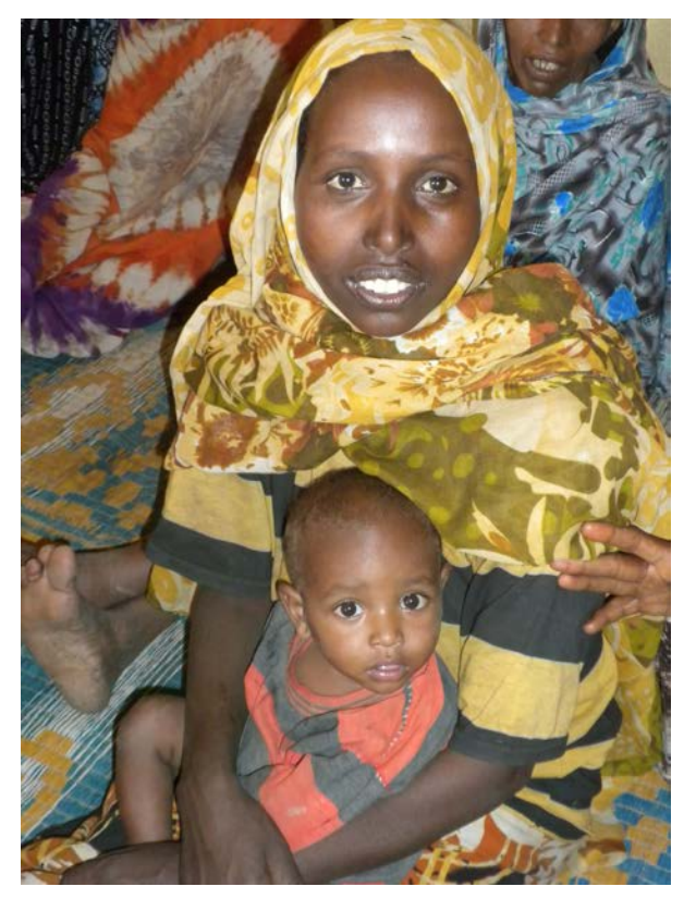
Woman with child participating in focus group discussion in Belewa kebele (Dire Dawa Administrative Council).

profits from her own businesses.<sup>26</sup> Men and boys must also be encouraged to take an active role in household health and nutrition, share reproductive tasks, and adopt more equitable and healthy marital relationships for more equal allocation of resources between male and female household members.