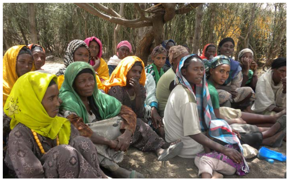
Woman participating in focus group discussions in Sire (Arsi Zone).