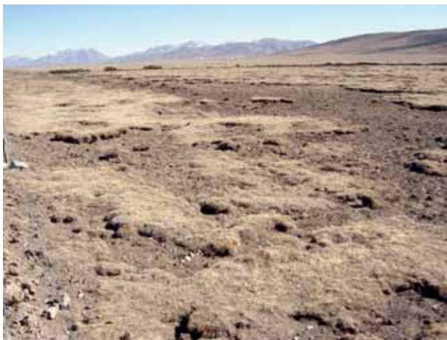
PHOTO 4 Grassland degradation in Zeku county, Qinghai province, China.

Conant and Paustian (2002) estimated that a transition from heavy to moderate grazing can sequester 0.21, 0.09, 0.05, 0.16, and 0.69 Mg C ha per year in Africa, Australia/Pacific, Eurasia, North America and South America, respectively. They also estimated, at a very general level, a potential sequestration capacity of 45.7 Tg C per year through cessation of overgrazing, although research also has found that some grasslands sequester more carbon in response to heavier grazing intensities. Reeder and Schuman (2002) reported higher soil C levels in grazed – compared to un-grazed – pastures, and noted that when animals were excluded, carbon tended to be immobilized in above-ground litter and annuals that lacked deep roots. After reviewing 34 studies of grazed and ungrazed sites (livestock exclusion) around the world, Milchunas and Lauenroth (1993) reported soil carbon was both increased (60 percent of cases) and decreased (40 percent of cases).