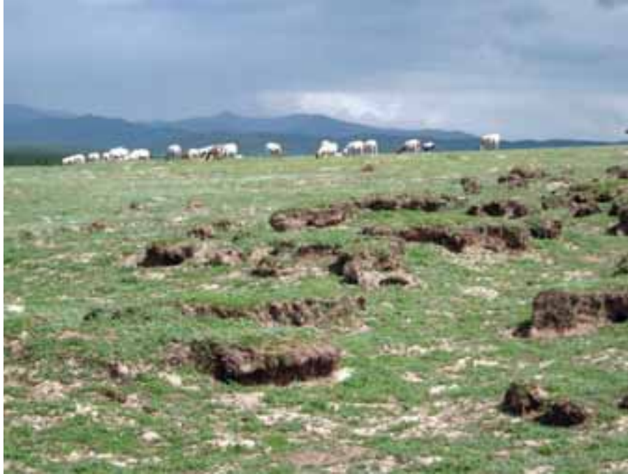
PHOTO 3 Erosion of alpine grassland surface vegetation and topsoil emits CO 2 (Zeku country, Qinghai province, China)