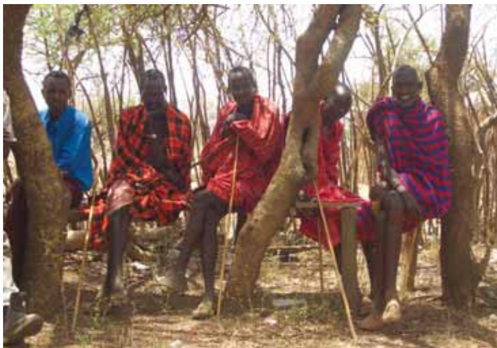
PHOTO 6 Maasai elders in Mosiro, Kenya, discussing the impacts of the ongoing drought